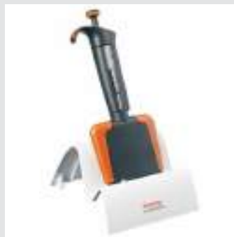
Multichannel Pipette Stand