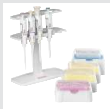
Finnpipette F1 GLP kit 1