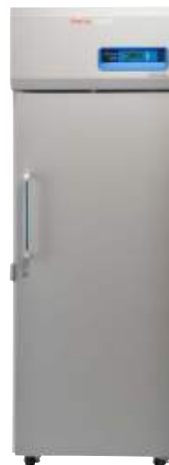
Thermo Scientific™ TSX 659 liter freezer