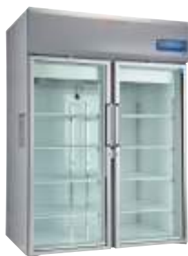
Thermo Scientific™ TSX 1447 liter Refrigerator