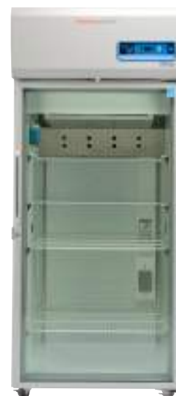
Thermo Scientific™ TSX 827 liter chromatography refrigerator