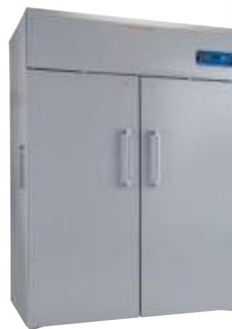
Thermo Scientific™ TSX 1447 liter freezer