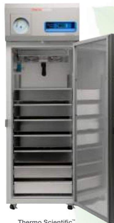
Thermo Scientific™ TSX 659 liter plasma freezer