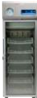
Thermo Scientific™ TSX 650 liter Pharmacy Refrigerator