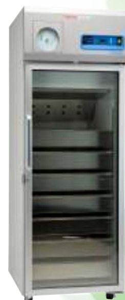
Thermo Scientific™ TSX 650 liter blood bank refrigerator