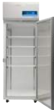
Thermo Scientific™ TSX 650 liter Manual Defrost Freezer