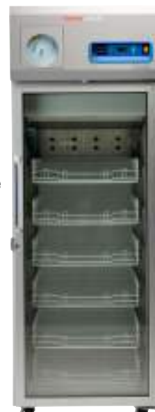
Thermo Scientific™ TSX 650 liter pharmacy refrigerator