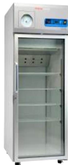
Thermo Scientific™ TSX 650 liter refrigerator