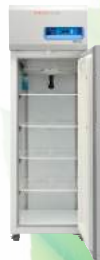
Thermo Scientific™ TSX 326 liter freezer