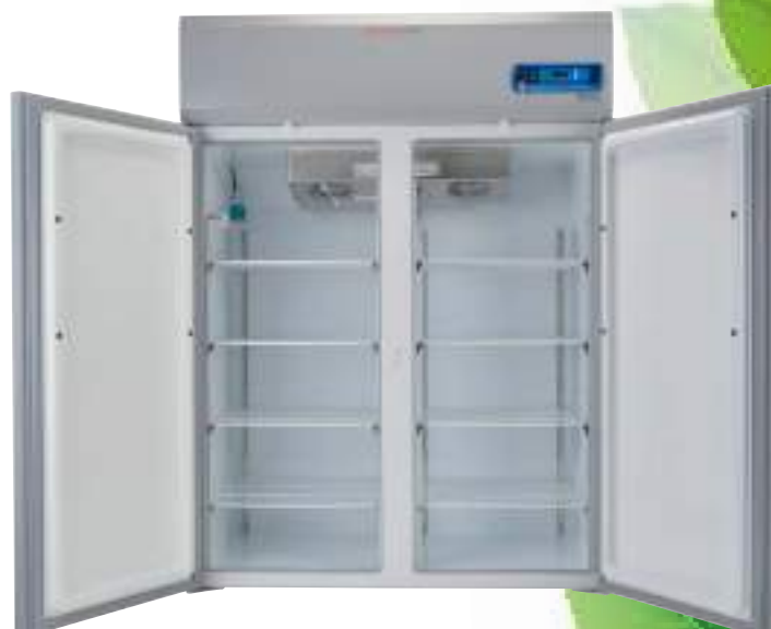
Thermo Scientific™ TSX 1447 liter refrigerator