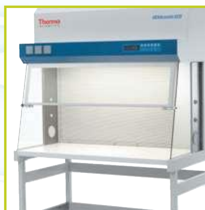
Wind screen protection kit