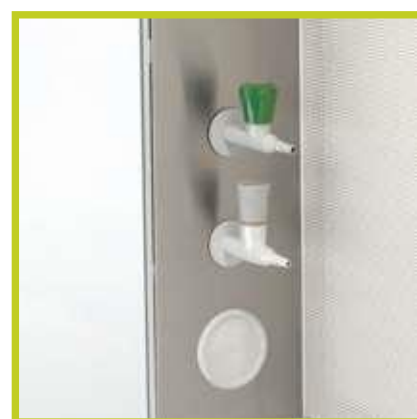
Left hand glass with metal sheet and two service valves