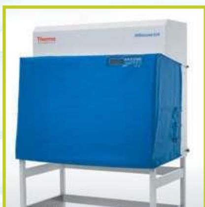
UV-resistant night cover