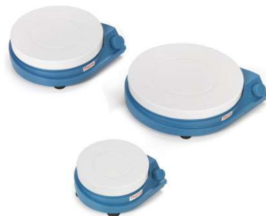
RT Basic Series Magnetic Stirrers

Certifications: cCSAus (100-120V models), CE (230V models), RoHS Compliant