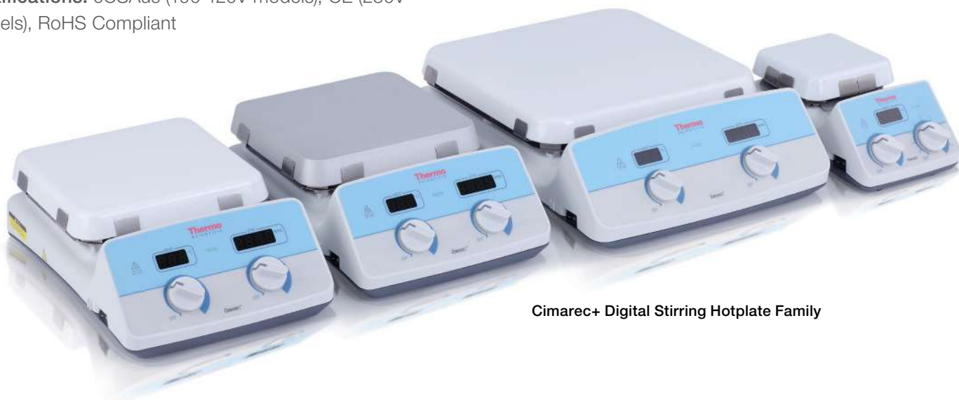
Cimarec+ Digital Stirring Hotplate Family

Certifications: cCSAus (100-120V models), CE (230V models), RoHS Compliant