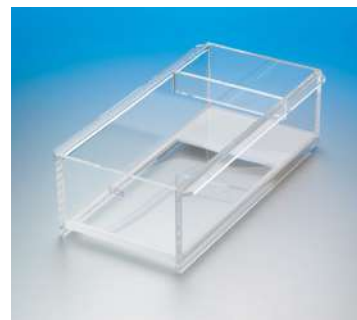
Cimarec i Bath Mounts