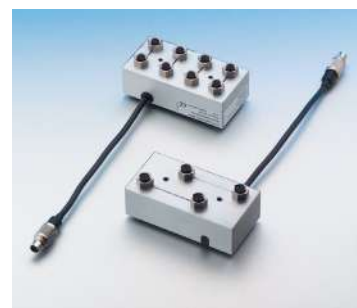
Cimarec i Benchtop Distributors