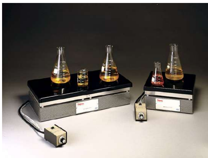
Large External-Controller Hotplates