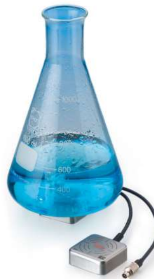
Cimarec i Micro Stirrer