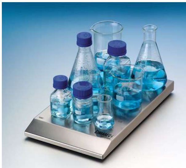
Cimarec i Telesystem Multipoint Stirrer

Operating conditions: -10° to +56°C at 100% RH in air; 0° to 50°C submerged in water. 100-240 V units contain a cord set with various plugs