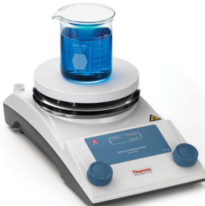
RT2 Basic Hotplate Stirrer

Optional: Non-slip heating bath, transparent shield and supporting rod