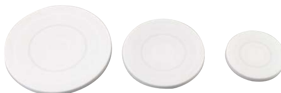
Non-slip silicone plate covers