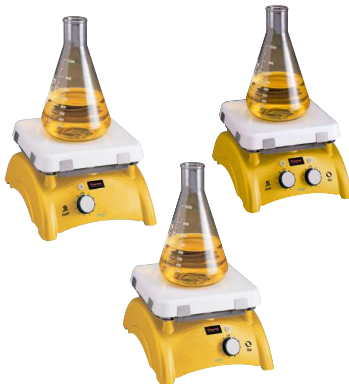
Cimarec Basic Hotplate and Stirring Hotplates