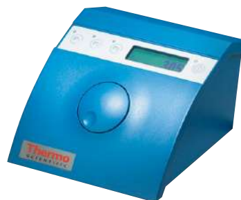
Cimarec i Teleomodul 40C and 20C Controller