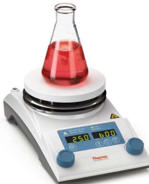
RT2 Advanced Hotplate Stirrer

Includes: Temperature probe (PT100, B Class)