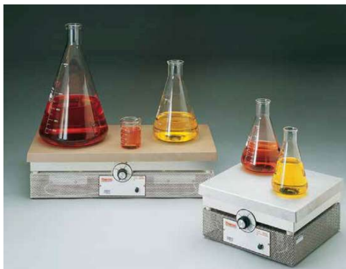
2200 Series Aluminum Top Hotplates

Alert: Recommended for use with glass vessels only