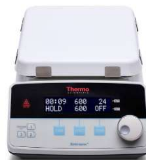
Super-Nuova+ Stirring Hotplate

Includes: PT100 Temperature probe, supporting rod and clamp kit (only for hotplates and stirring hotplates); Stir bar (only for stirrers and stirring hotplate)