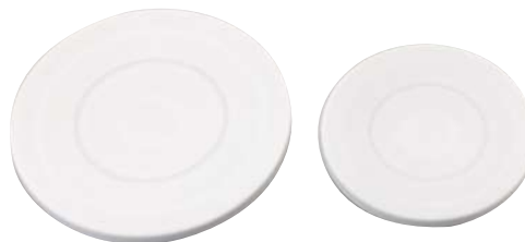
Non-slip silicone plate covers

Certifications: cCSAus (100-120V models), CE (230V models), RoHS Compliant