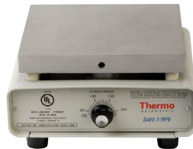
Explosion-Proof SAFE-T HP6 Hotplate

Includes: Stirrer unit and one 2 × 0.38 in. (5 × 1cm) PTFE-coated stir bar