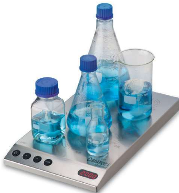
Cimarec i Multipoint 15 Stirrer

Operating conditions: -5 to +40°C at 95% rH; 100-240 V units contain a cord set with various plugs