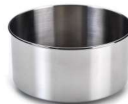
Heating Bath for RT2 Digital Hotplate