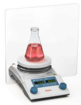
RT2 Digital Hotplate with transparent shield