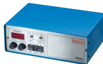
Cimarec 40B Telemodul Controller