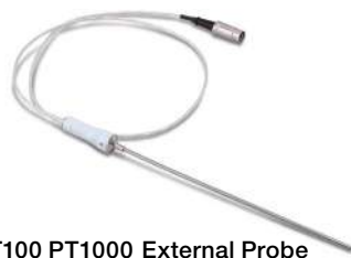
PT100 PT1000 External Probe