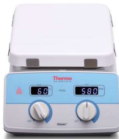
Cimarec+ Digital Stirring Hotplate

Includes: Stir bar (*only for stirrers and stirring hotplate models)