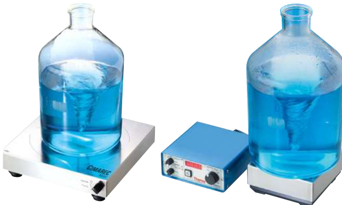
Cimarec Mobil Direct Stirrers