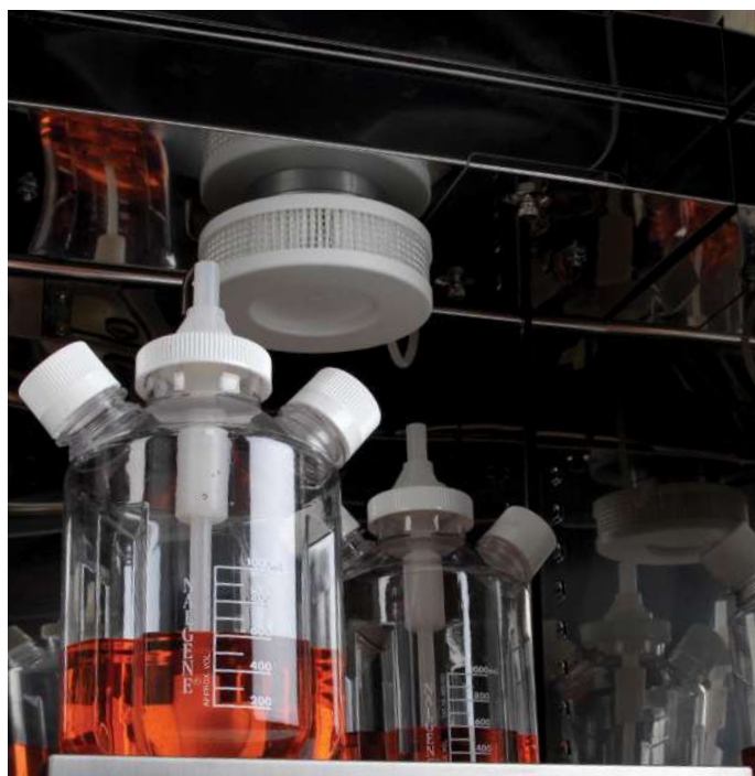
Cimarec i Biosystem Slow Speed Stirrer

Operating conditions: -10 to +56°C at 100% rH; 100-240V units contain a cord set with various plugs