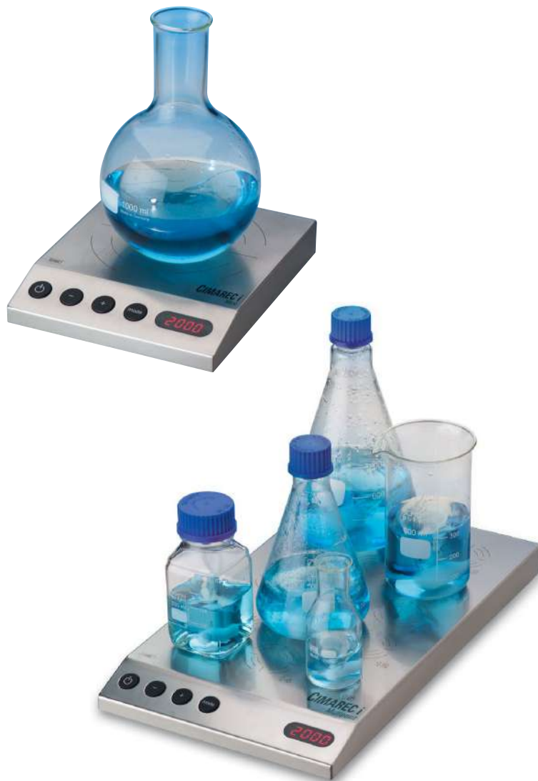
Cimarec i Magnetic Stirrers