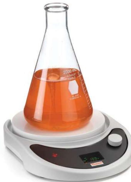
RT Touch Series Magnetic Stirrer

Includes: Stir bar and two non-slip silicone plate covers (1 black, 1 white)