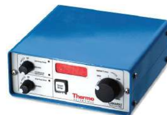
Cimarec 40M and 80M Controller