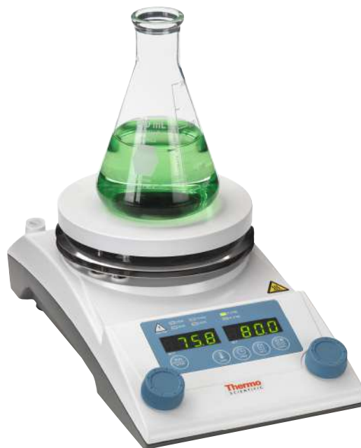
RT2 Digital Hotplate

Optional: Non-slip heating bath, transparent safety shield