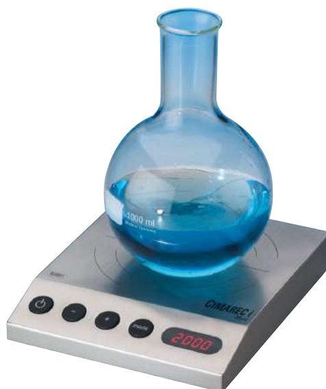
Cimarec i Maxi Direct Stirrer

Operating Conditions: -10° to +40°C at 95% RH. 100-240V units contain a cord set with various plugs.