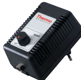
Cimarec i Standard Teleomodul Controller