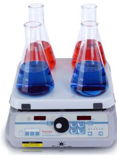
Super-Nuova Multi-Position Digital Stirrer

Certifications: cCSAus (all models), CE (220-240V models)